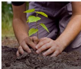
Forestry (soil preparation, planting, growing, cutting trees)