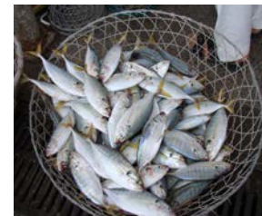
Fishing & Fish Processing (catching, sorting, packing, transporting fish)

If you answered "yes" to either question above, please continue below. Otherwise, your form is complete.