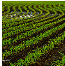
Agriculture or Field Work (planting, picking, sorting crops, soil preparation, irrigation, fumigation)