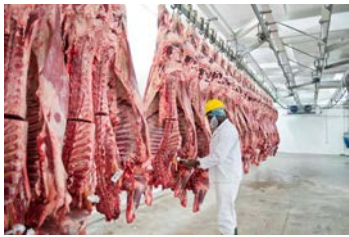
Processing & Packing (fruit, vegetables, chicken, eggs, pork, beef, lamb or other livestock)

CIRCLE all that apply below, even if the work was only for a short period of time.