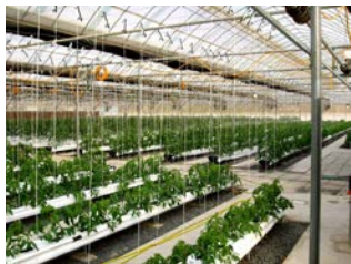
Nursery or Greenhouse (planting, potting, pruning, watering, harvesting)